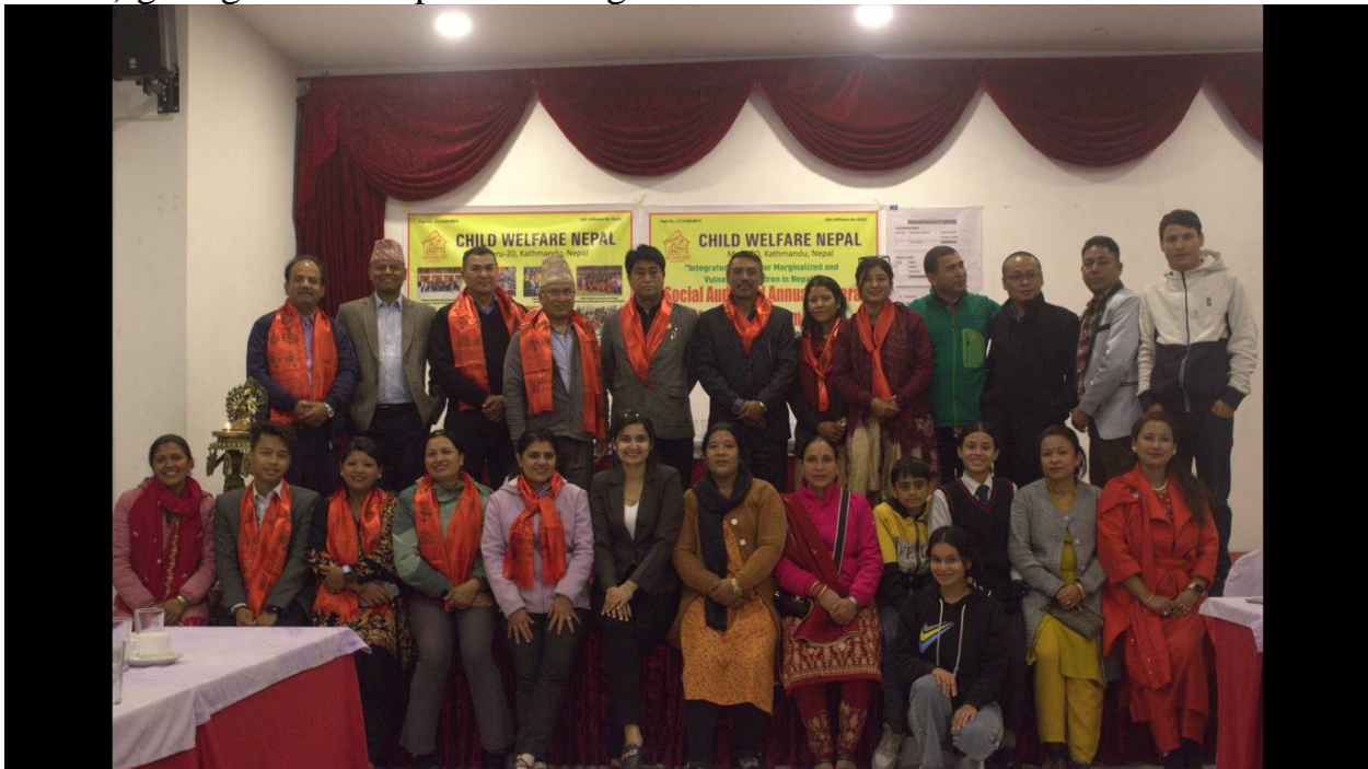
Photo description: A file group photo of all the participants during social function.