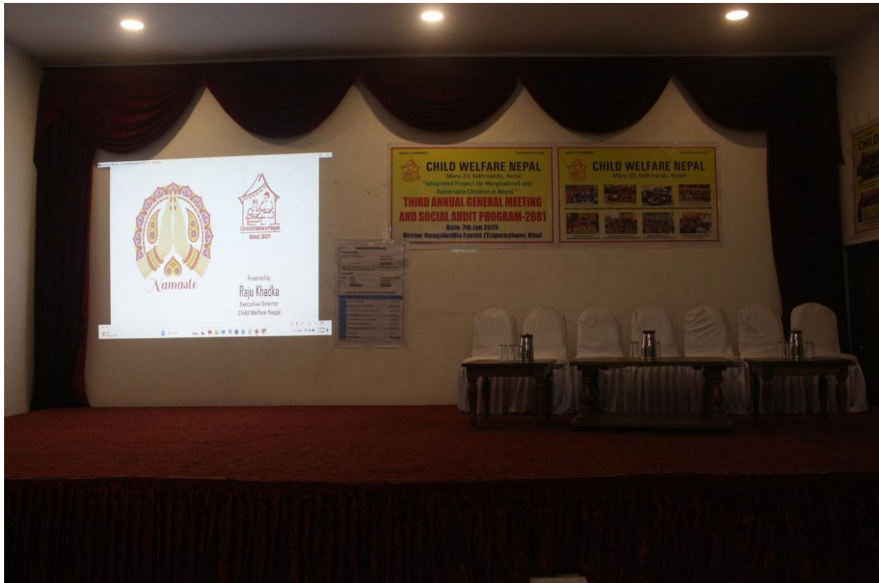
File photo of the banner, flex and presentation printed and displayed for the THIRD AGM and Social Audit Program, 2025.