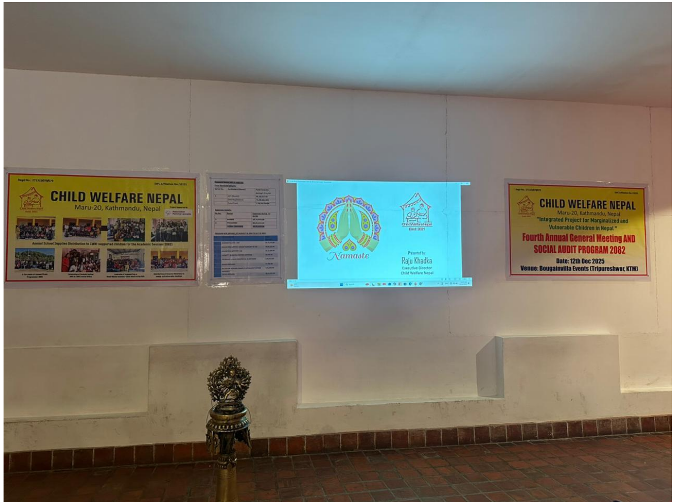
A file photo of the banner and flex printed for the AGM and Social Audit Program 2082.