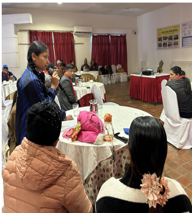
A file photo of stakeholders giving their views during social audit & interaction program