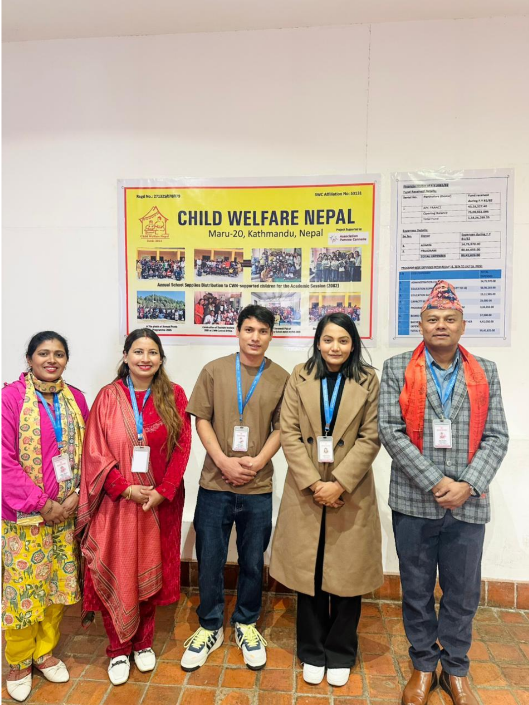
A file photo of CWN staff members clicked during the social audit function.