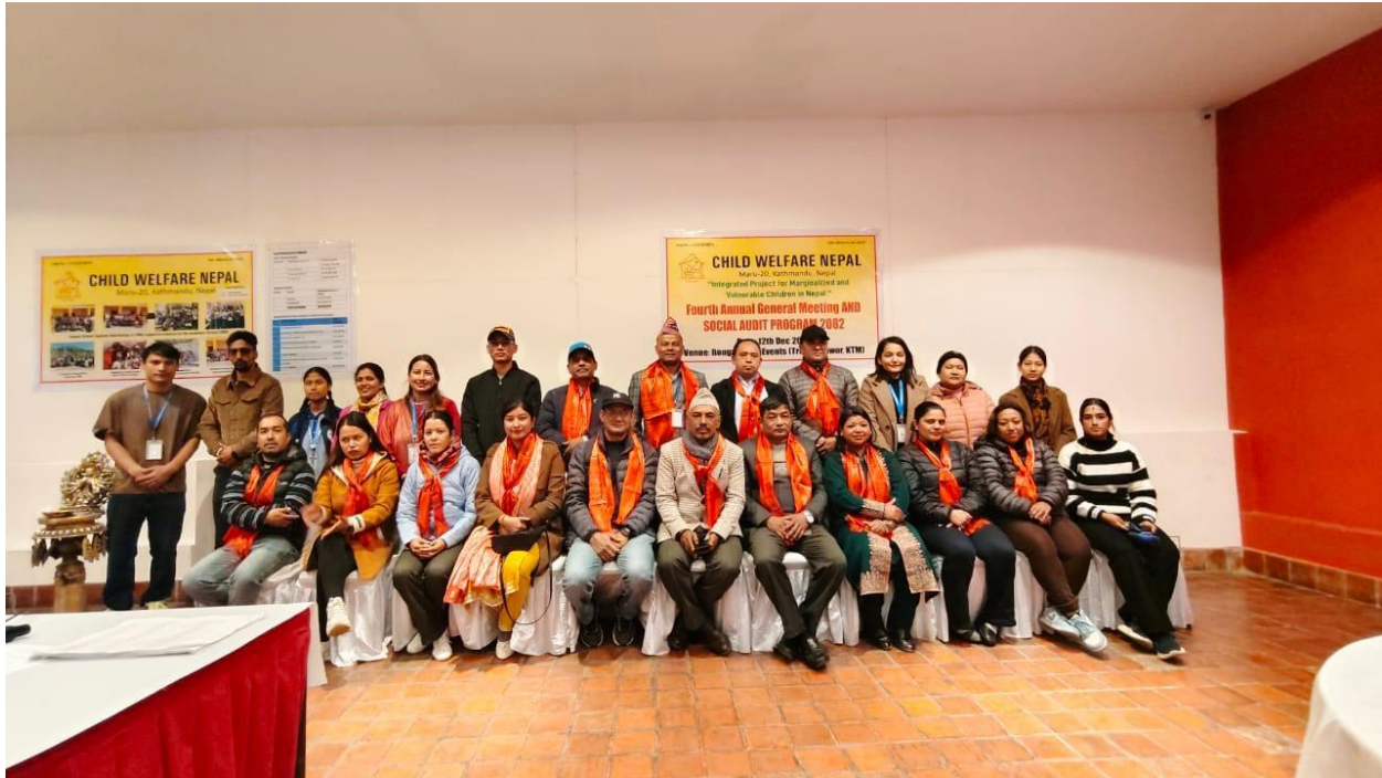
A group file photo taken during the social audit program.