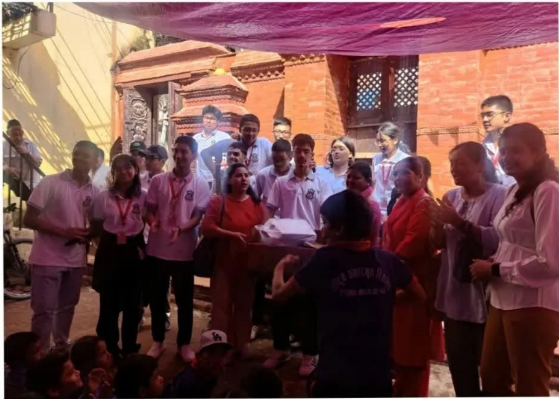
St. Xavier's students conducted the fun and gaming activities in collaboration with Rastriya BASIC School.