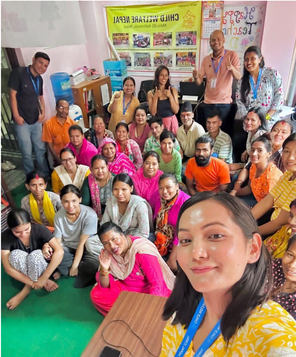
A file photo of the family meeting with the donor agency.