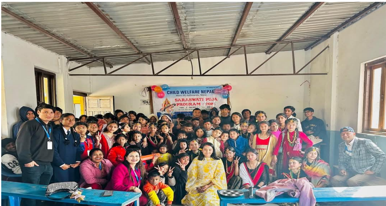
A group file photo of the SARASWATI PUJA PROGRAM dated 03 February, 2025.