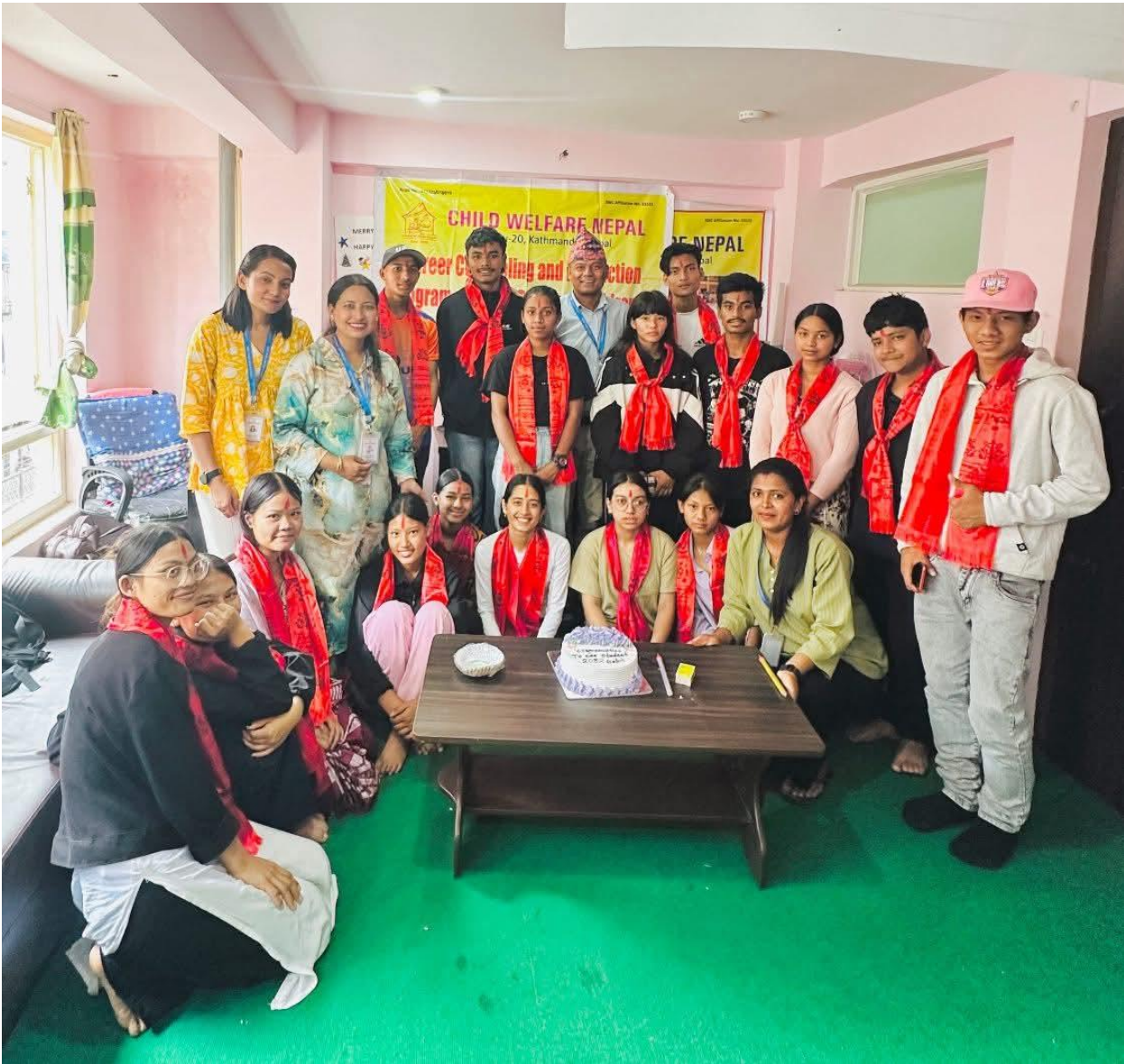
A file photo of the career counseling program to SEE graduates 2082.