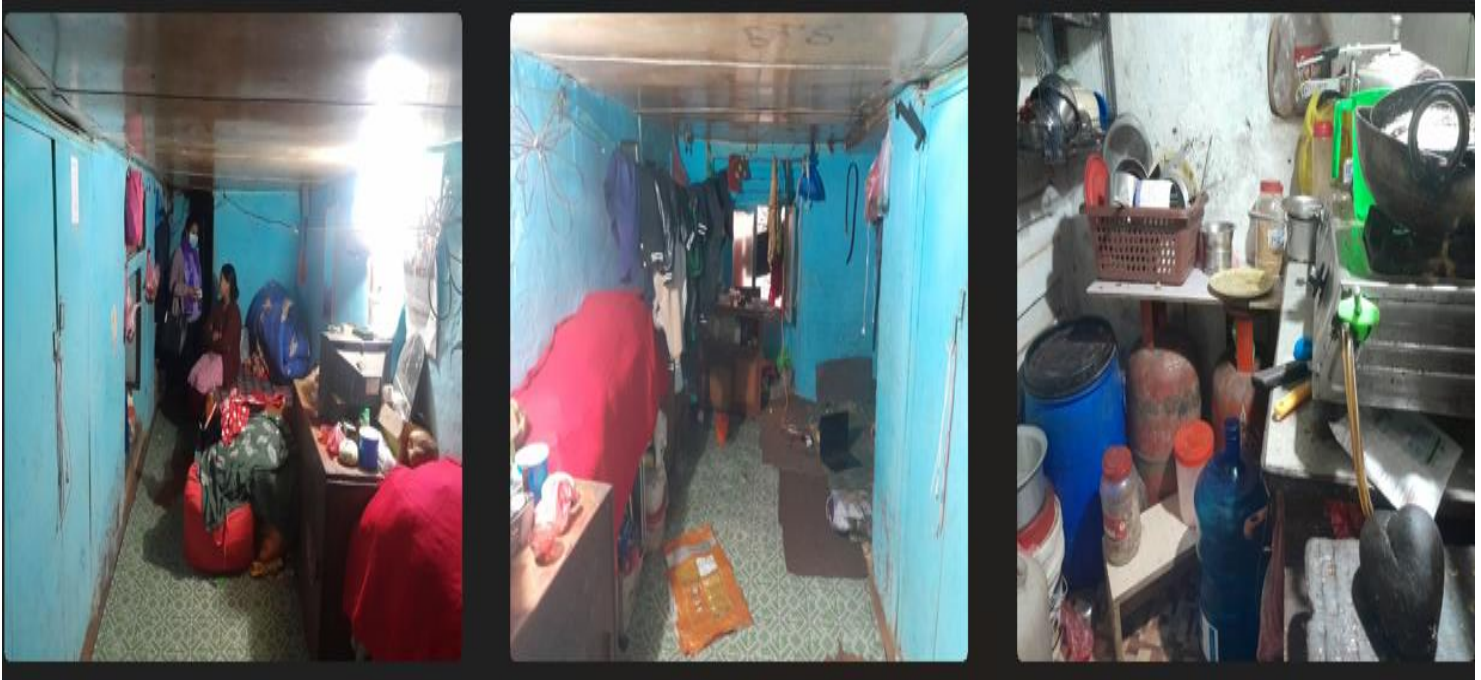
A file photo of Anju and Rohit Mahato’s living situation inspection conducted during the Family Visit and Economic Assessment Task in February 2025.