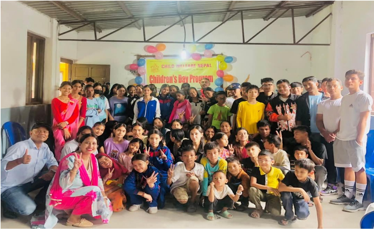
File photo of the Children's Day Program dated 14 th September 2024.