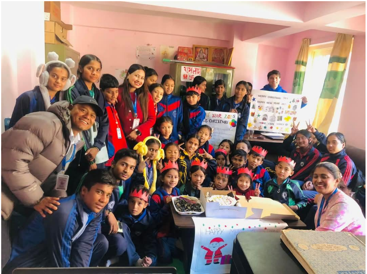
CWN staff members and children celebrating Christmas 2024 at the central office.