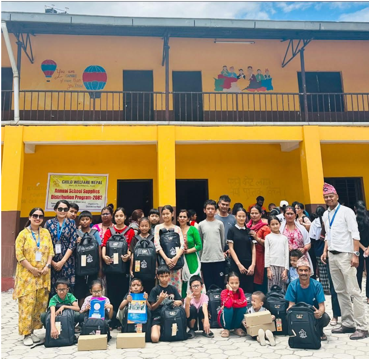
A file photo of the Annual School Supplies Material Distribution Program.