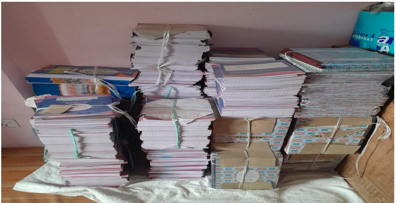
A file photo of the stationery distribution to Majhi children in Kavrepalanchok, Bhumlu RM-6.