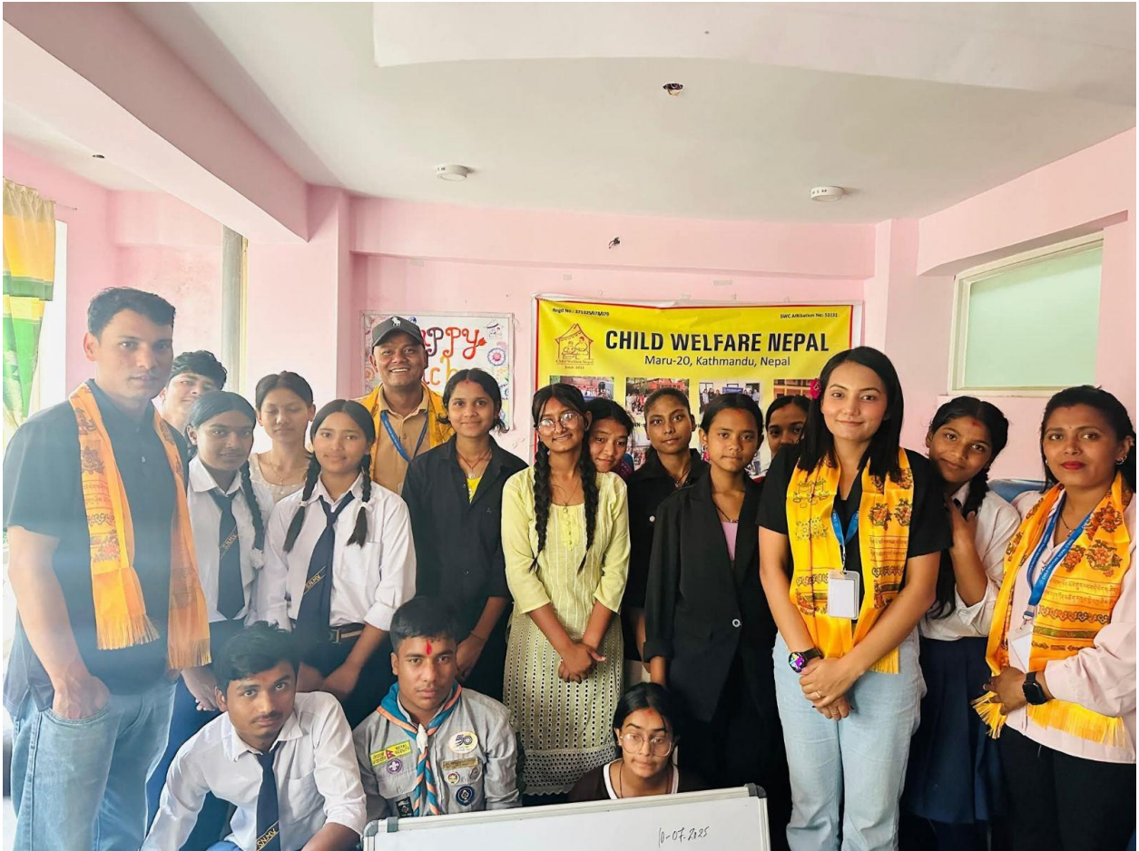
A file photo of children and CWN staff members celebrating GURU PURNIMA.