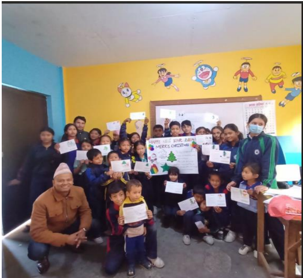
In photos, children are displaying Christmas and New Year postcards and letters written to the APC-FRANCE members.