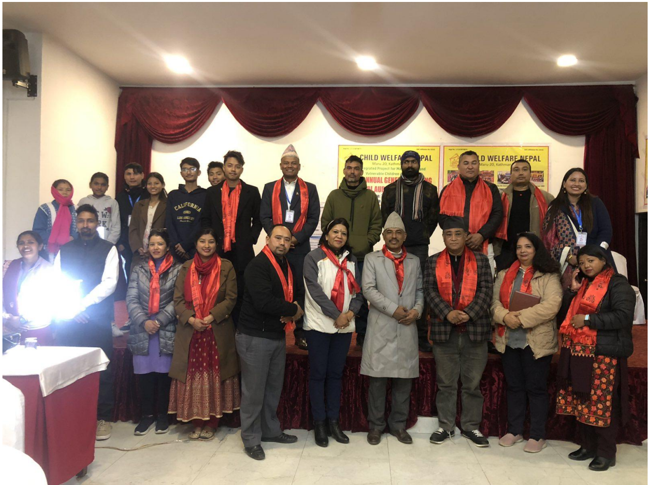
A file photo of the Annual General Meeting and Social Audit Program.