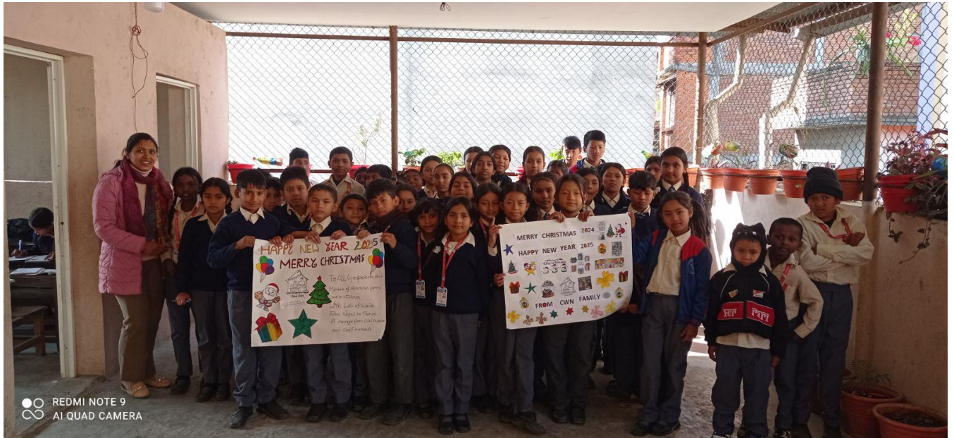
Referral of six scholars to the Triple Gems Foundation and Hostel for the academic session 2081.