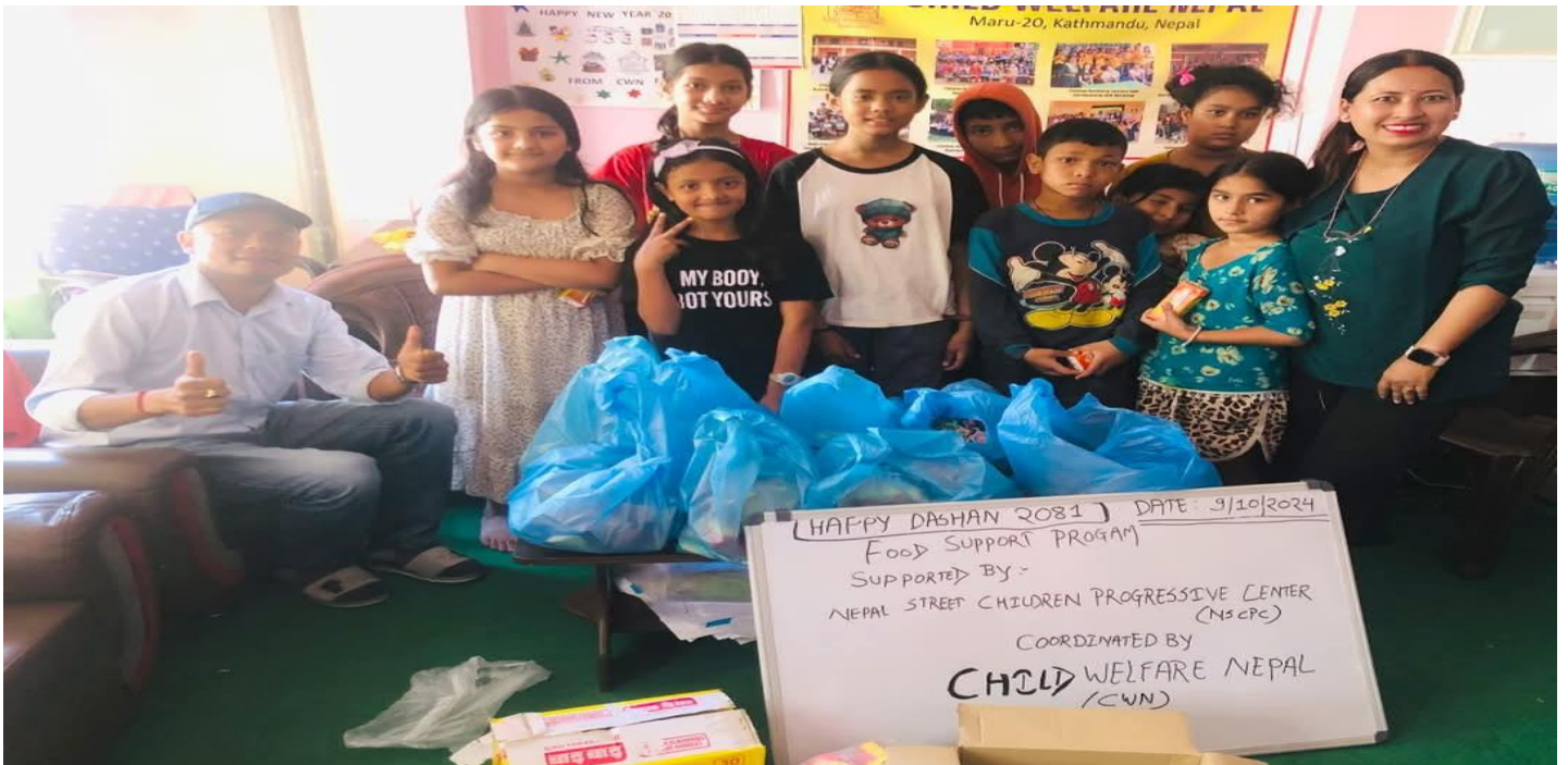
A file photo of the grocery materials distribution program to needy and vulnerable families/children dated 12 April 2025.