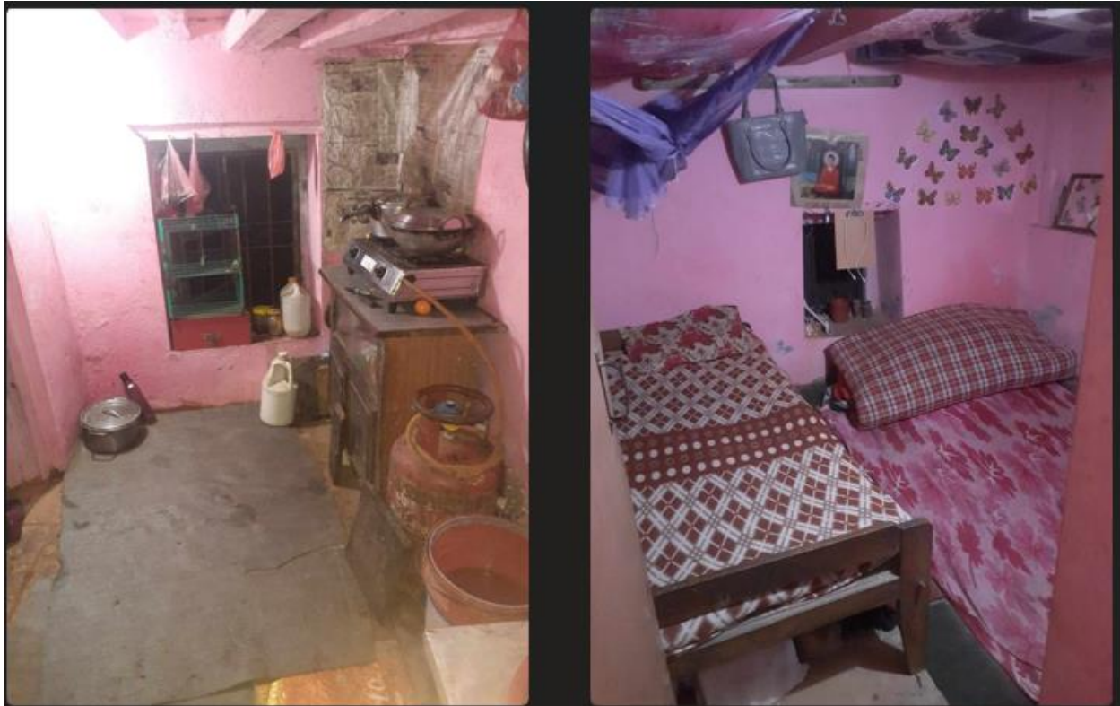
A file photo of Sandip Shiwakoti’s living condition was clicked during the Family Visit Task in March 2025.