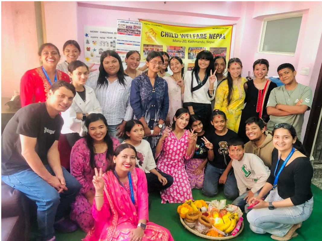
In photos, CWN staff members and children celebrate the Dashain and Tihar (Deusi/Vailo) Program at the CWN central office.