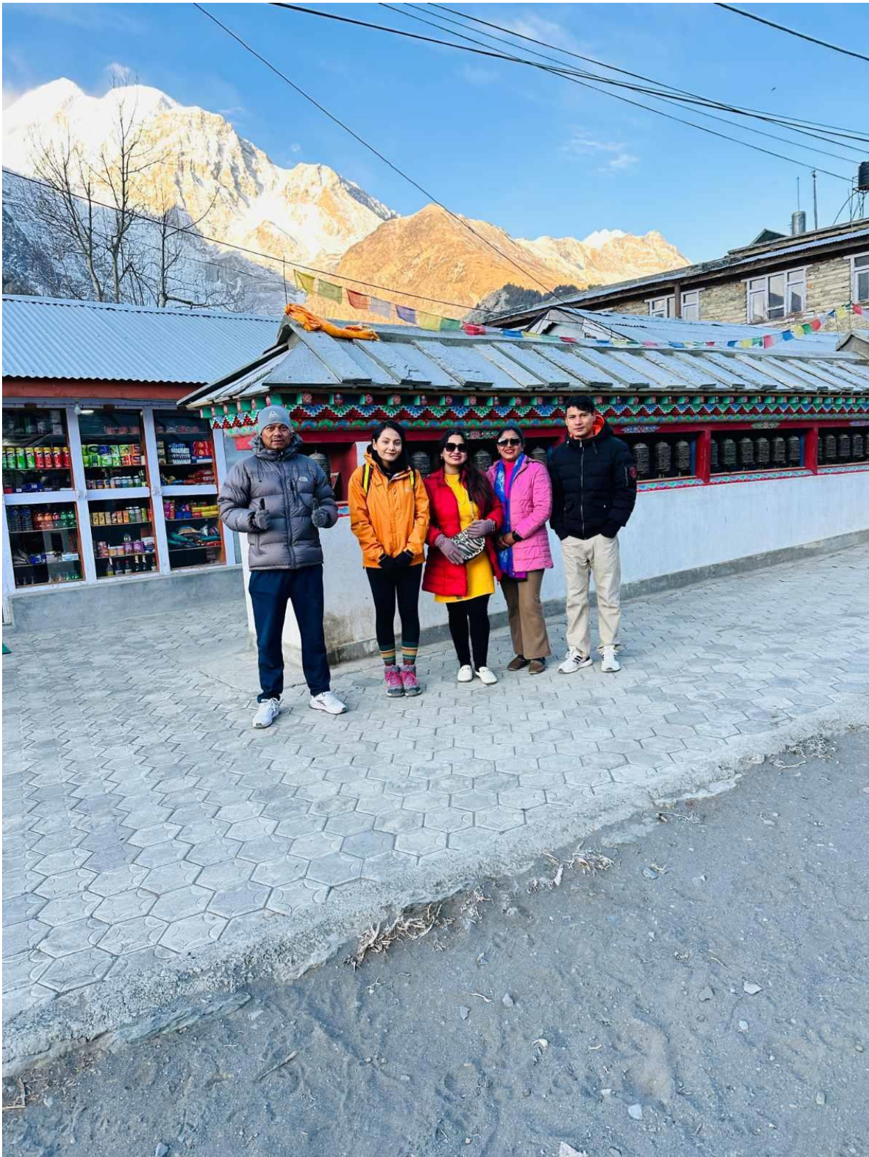
A group photo of CWN staff members pictured at Manang village.