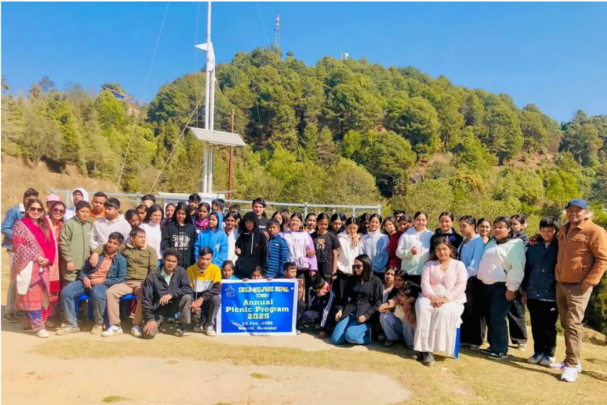
Children and CWN staff members clicked during the Annual Picnic Program at Kakani, Nuwakot.